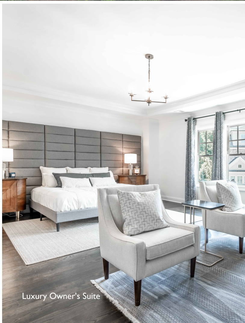
Luxury Owner's Suite