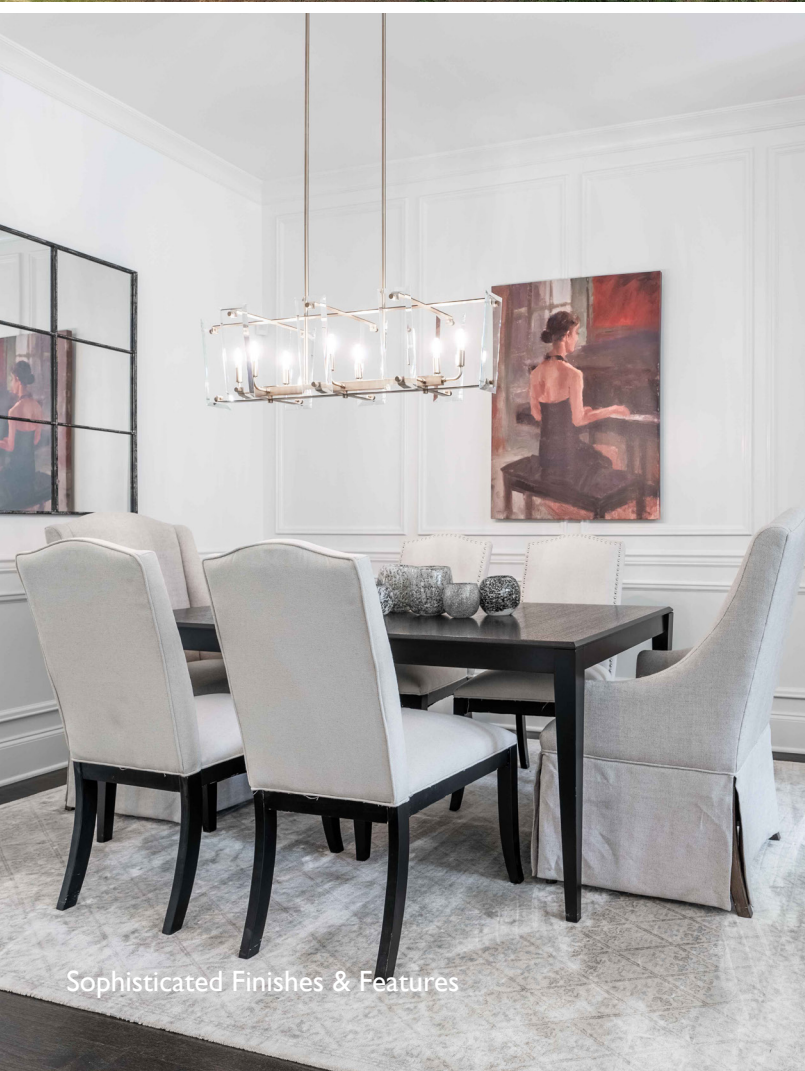
Sophisticated Finishes & Features