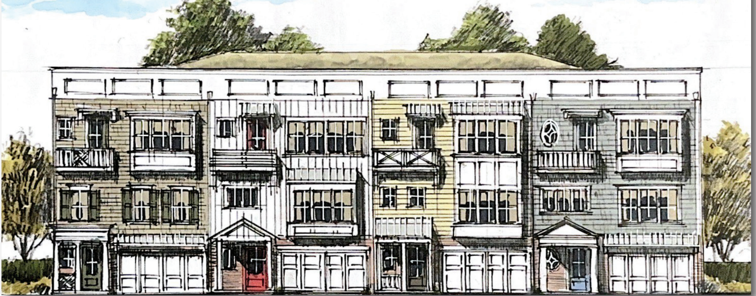
The Washington Plan at Heritage Hall