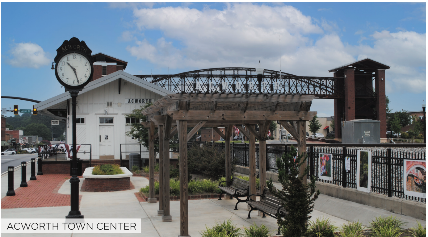
ACWORTH TOWN CENTER

Owners at The Heritage at Acworth will enjoy its premium Acworth location, which is just across Main Street with its many dining options and engaging shops. Acworth's 120-acre Logan Farm Park and the Acworth Community Center are just steps away. This new neighborhood is just a short drive from Lake Allatoona, Kennesaw State University, I-75 and I-575 to Atlanta.