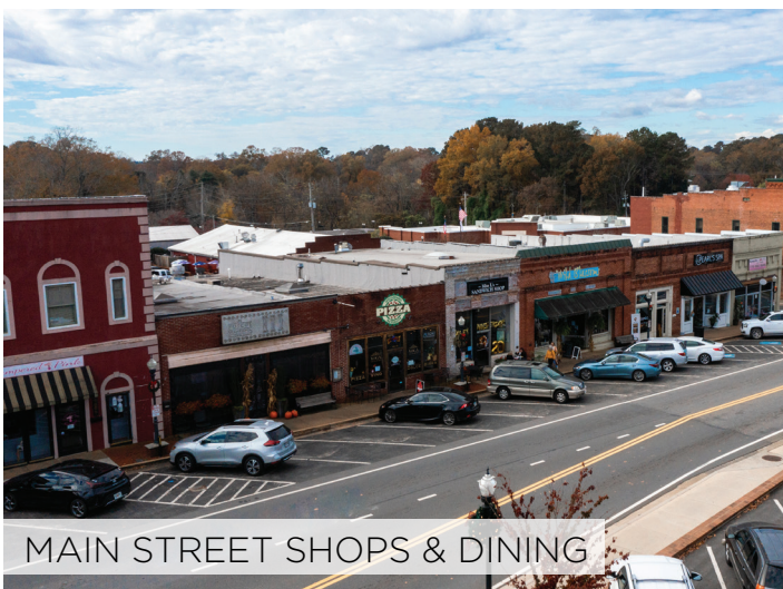
MAIN STREET SHOPS & DINING