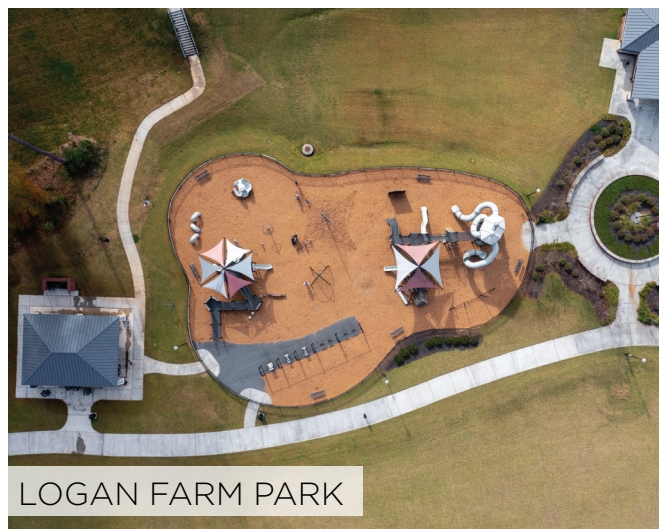
LOGAN FARM PARK