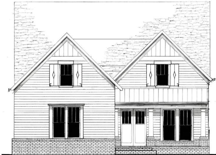
ELEVATION C — $2,500 PREMIUM