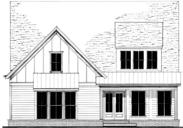
ELEVATION B — $3,500 PREMIUM