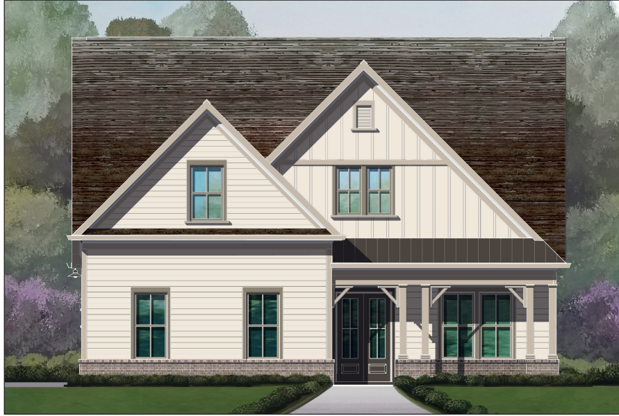
ELEVATION A — $5,000 PREMIUM