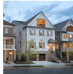
Enclave on Collier West Midtown