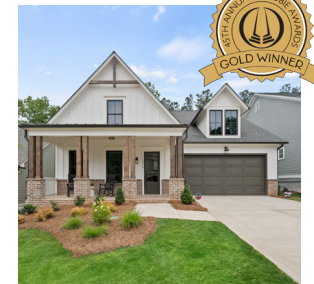
Lakeside at River Green Canton