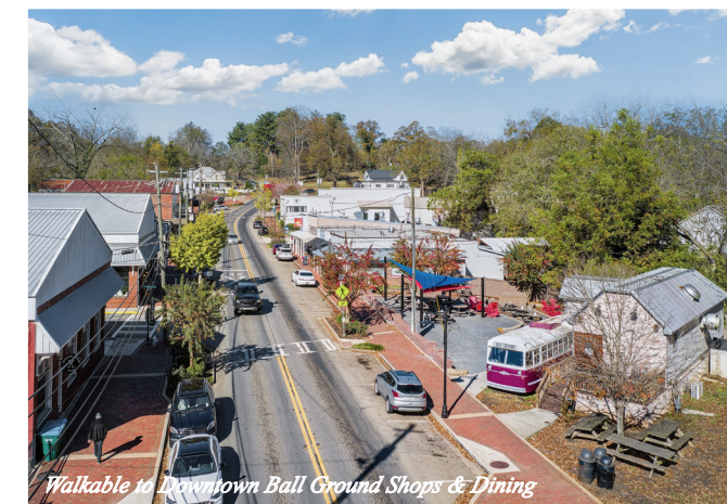
Walkable to Downtown Ball Ground Shops & Dining