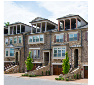
Paces View Vinings