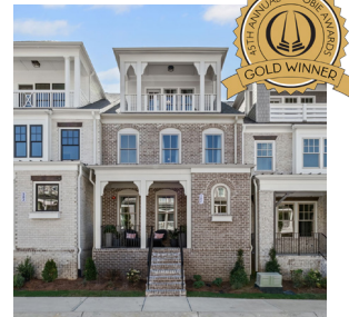
South on Main Woodstock