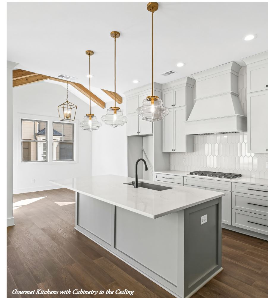
Gourmet Kitchens with Cabinetry to the Ceiling