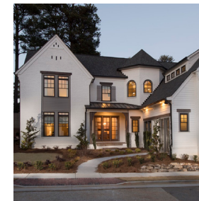
Dunwoody Green Dunwoody