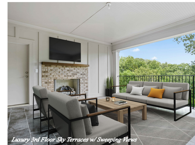
Luxury 3rd Floor Sky Terraces w/ Sweeping Views